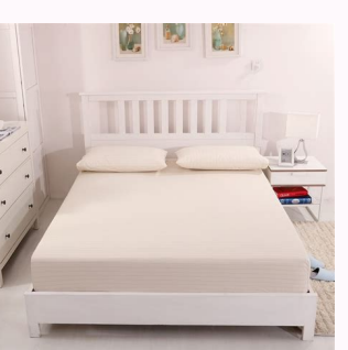
Earthing queen size fitted sheet.